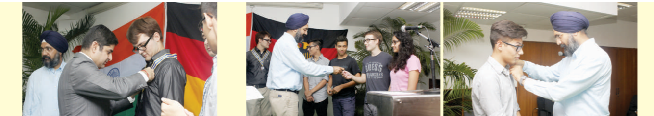
RCDM President presenting the Interact Collar to the President of the Interact Club.