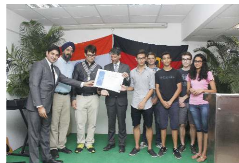
Certificate of Organization Officially Presented by RCDM President & Chair Person Interact committee