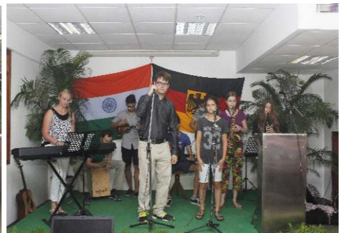
School Band enthralling the audience